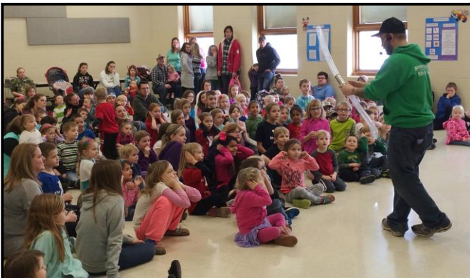
Families watching the Mischief & Magic Show at CFRC’s Winterfest Carnival – Feb. 2016

Throughout the year, CFRC promotes family togetherness by offering various events to all families interested in having fun such as the Winterfest Carnival, Easter Egg Hunts in Seymour & Black Creek, and Autumn Extravaganza.