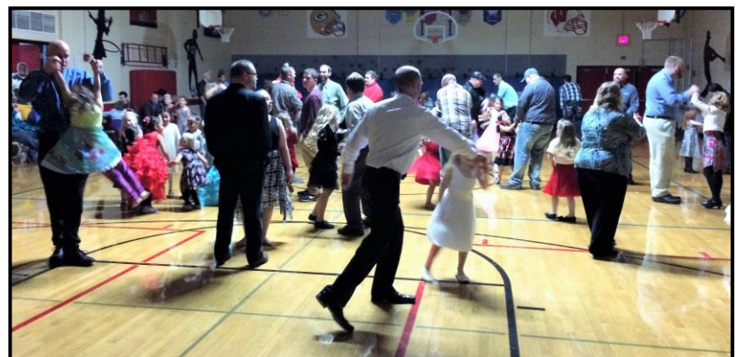
Girls and their dads & grandpas danced the night away at CFRC's 1 st Annual Father/Daughter Dance – Nov. 2016

The Me & My Family program is designed to promote each parent or family member to spend time individually with their children. Programs are offered for moms and kids (Me & My Mom), dads and kids (Me & My Dad), and grandparents and kids (Me & My Grandparent). And, some events are designed for the entire family to attend. The events typically take place in Seymour and Black Creek, showcasing some of the great, low cost entertainment in the area.