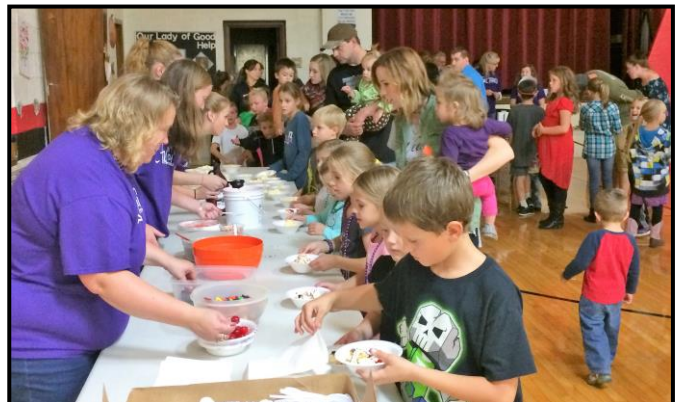
Families lining up for the ice cream sundae bar at CFRC’s Autumn Extravaganza – Oct. 2016