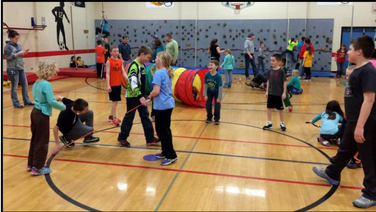
Families participate in the Nutrition & Fitness Family Fun Night held annually in Seymour & Black Creek – Seymour, Jan. 2016

Family Education. During the school year, CFRC provides monthly opportunities for families to learn more on pertinent topics. Presenters come from various fields of expertise to provide parents/guardians with information on topics like being active with your kids, discipline, talking about serious issues, and financial management.